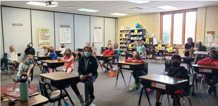
Be good friends & a class family

5th graders at Rock Ledge Intermediate are learning about architecture in art. They are creating pop-up Victorian houses which will have gables, gingerbread details, decorative shingles, and turrets (rounded towers).