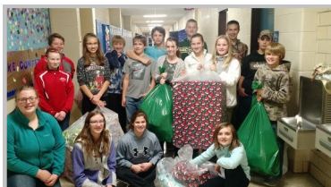
BC Middle School holds penny wars