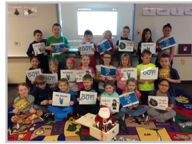
Rock Ledge Primary Students Break Out!