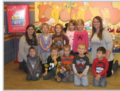
4K Students Build a Bear Team

On Friday, December 2, 2016, the Black Creek 4K program held a family outreach event at Build-a-Bear Workshop at the Fox River Mall. Each 4K class was able to build a classroom bear that was donated by our TAFTE organization. Prior to the event, the 4K students voted on their favorite bear, a name for their bear, and an outfit. Students then had the opportunity to attend the event and help build their classroom bear. Each child will be able to take their class bear home for a weekend and create a page for the bear's journal of all the fun things they did with their bear.