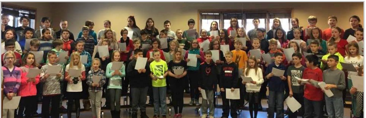
Rock Ledge Intermediate fifth grade students sang at Meadow Wood.

Seymour Community School District provides equal opportunity regardless of sex, race, color, age, handicap, or national origin.