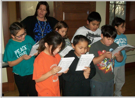
Youth Enrichment Services (YES) students singing at Impact Aid meeting.