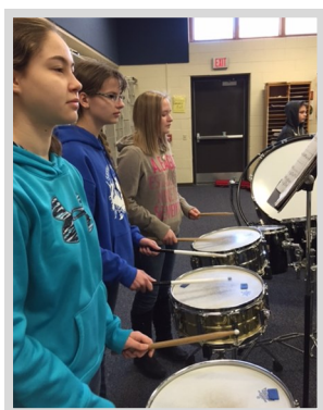
Drum Roll Please!