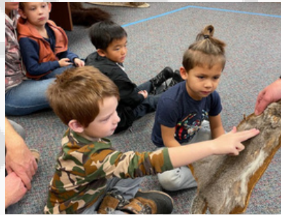
4K students enjoyed time at Fallen Timbers learning about how animals prepare for winter.