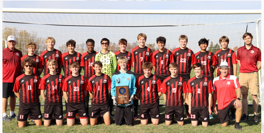
The Boys' Soccer team became Bay Conference champs for the sixth time, as well as Regional Champs!