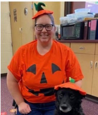
Even the Luna the therapy dog is excited for Halloween!