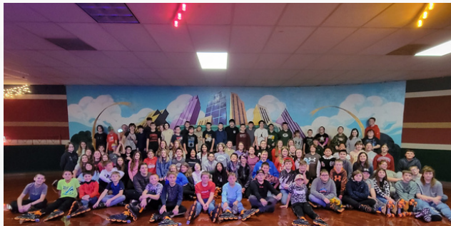
Black Creek Middle School students enjoyed a day out at Skate City for their first trimester incentive.