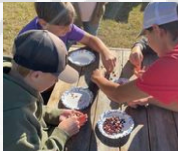
Seymour students attended a cultural day in Oneida including the annual Corn Husking event at Tsyunhehkwa.