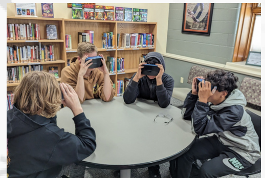
SMS World Language students used virtual reality to explore ten different locations in Spain.