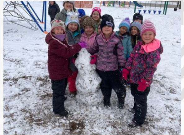
Black Creek students enjoyed the first snowfall during recess!