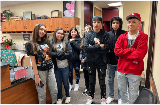
During Native American Heritage month, Seymour High School students shared information about a few of the federally recognized tribes during morning announcements.